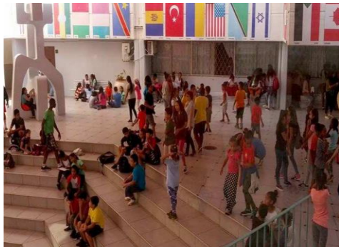
Photo 15 - SCHOOLS RE-OPENING