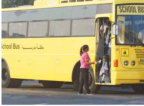
Photo 13 - SCHOOLS RE-OPENING