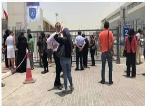
Photo 16 - SCHOOLS RE-OPENING